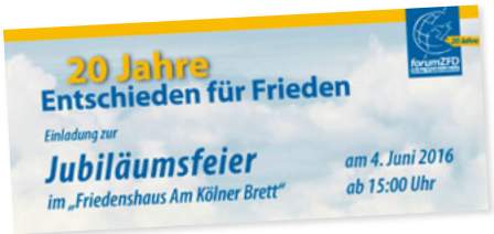
Postcard invite for the anniversary celebrations

In parallel to this, we continued the work in our three areas of activity throughout the year: