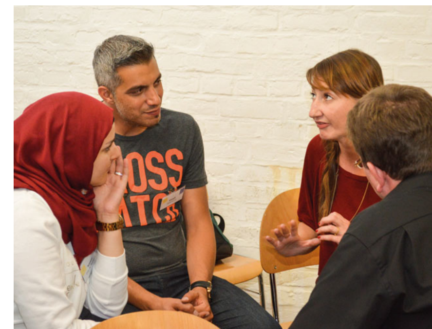
Images p. 5–8: The exchange of experiences during the international workshop marking forumZFD’s twentieth anniversary was extremely helpful to future organisation of the project work.