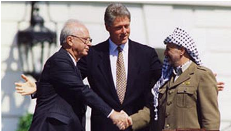
In 1993, Yitzhak Rabin and Yasser Arafat signed a ‘Declaration of Principles on Interim Self-Government Arrangements’ for Palestine in the presence of US President Bill Clinton. The signing of this declaration brought hope for both the peace process and to the world.