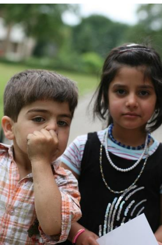
Municipal conflict consulting helps to enable children to grow up in a peaceful environment.

New in this case was that the general public received comprehensive information without any prejudices being confirmed or anything being whitewashed or kept secret. A forumZFD advisor worked with the responsible person from the town to assist in this approach and prevent violent confrontations from recurring between the rival families. There's also a background to the successful de-escalation. In the three-year cooperation between the town and forumZFD, preventive steps were introduced, such as regular neighbourhood forums to respond to residents' specific questions and problems. The coexistence of the long-term residents and the migrant families has become far more relaxed due to a variety of factors. Even if violence conflicts do occasionally arise – as was the case in the aforementioned incident – they no longer end in family feuds.