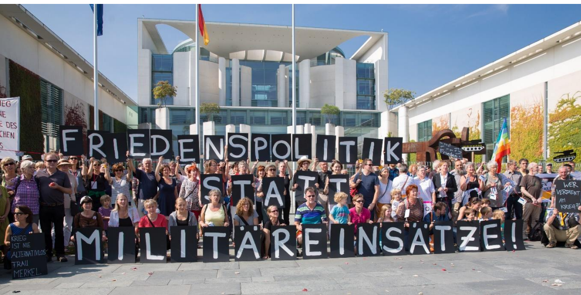
The ‘Aktion Weißes Friedensband’ (‘White Ribbon of Peace’) initiative in front of the Federal Chancellery in summer 2014.