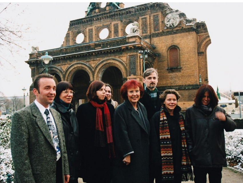
An important milestone in forumZFD's history: in the winter of 1998, Heidi Wiecek-Zeul, who was the development minister at the time, official deployed the first peace workers from the Civil Peace Service in front of Anhalter Bahnhof in Berlin.