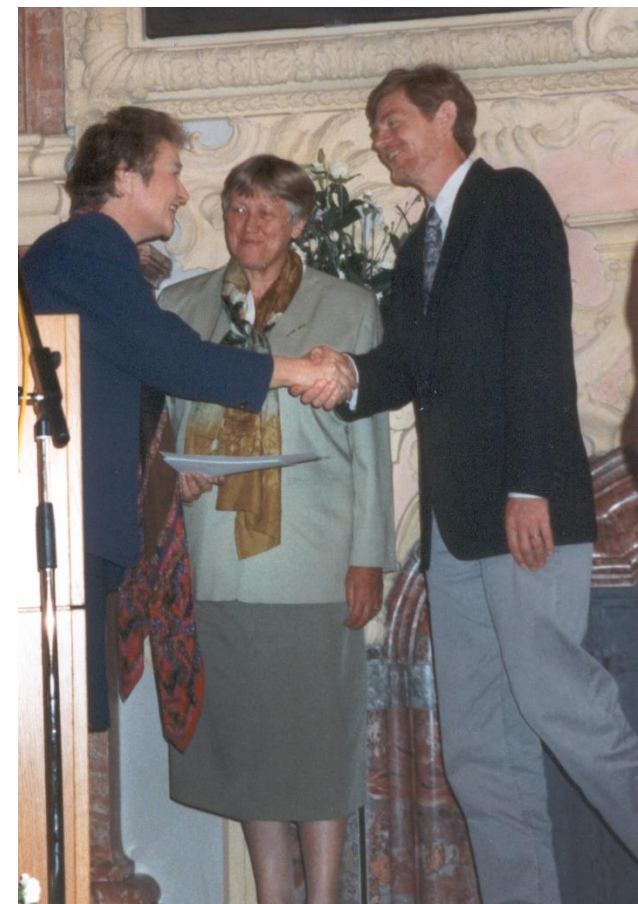
Awarding of the Gustav-Heinemann Citizens’ Prize in 1997.