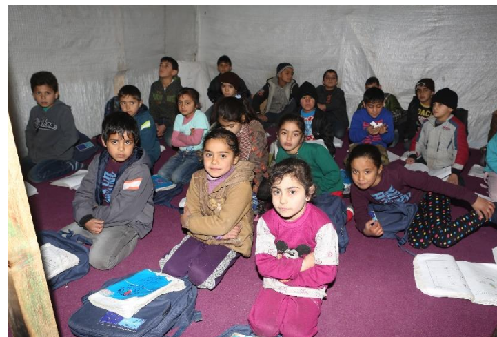
A school in a Lebanese refugee camp.