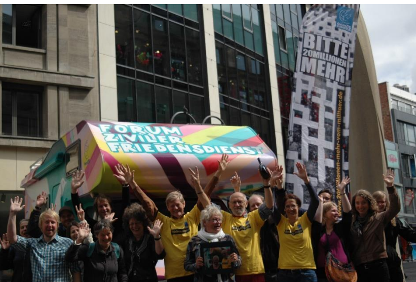
In 2013, the Peacemobile (here in Cologne) toured Germany for the Civil Peace Service.