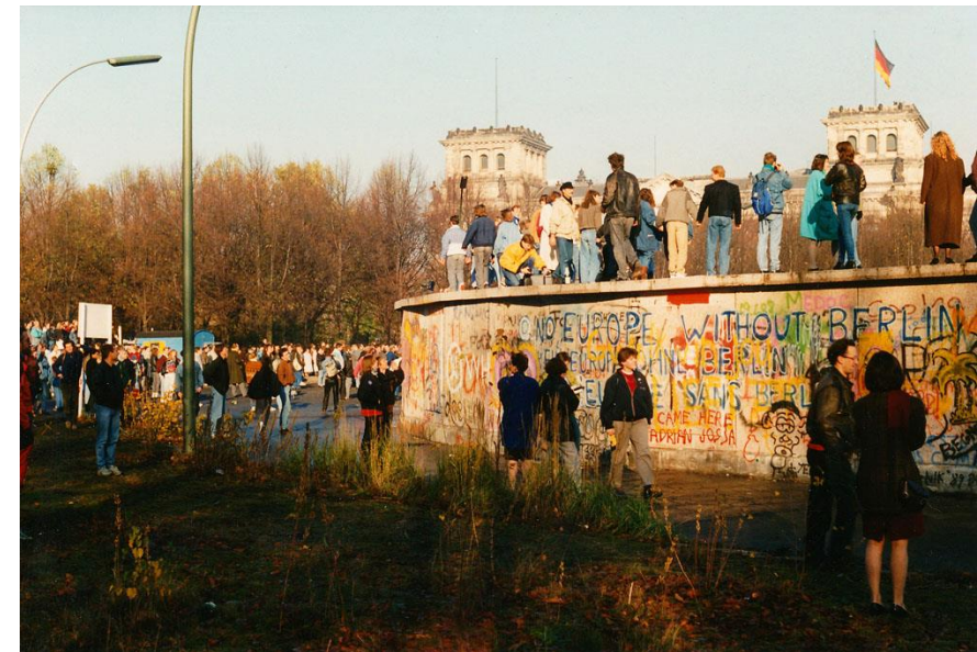
forumZFD’s founding generation was shaped by the fall of the Berlin Wall.