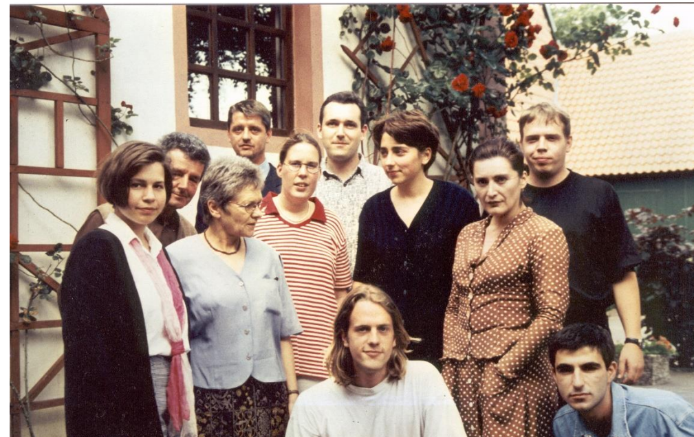
Participants in the second CPS training course in 1998.

Helga Tempel: But we shouldn’t forget just how much conceptual work went into the planning. Konrad Tempel had developed a 40-page, one-year training plan that built on the ideas of many of the pioneers of non-violent action. A central concept of this extensive curriculum has remained in place to this day: reflecting on one’s own conflict behaviour within the group should form part of the training.